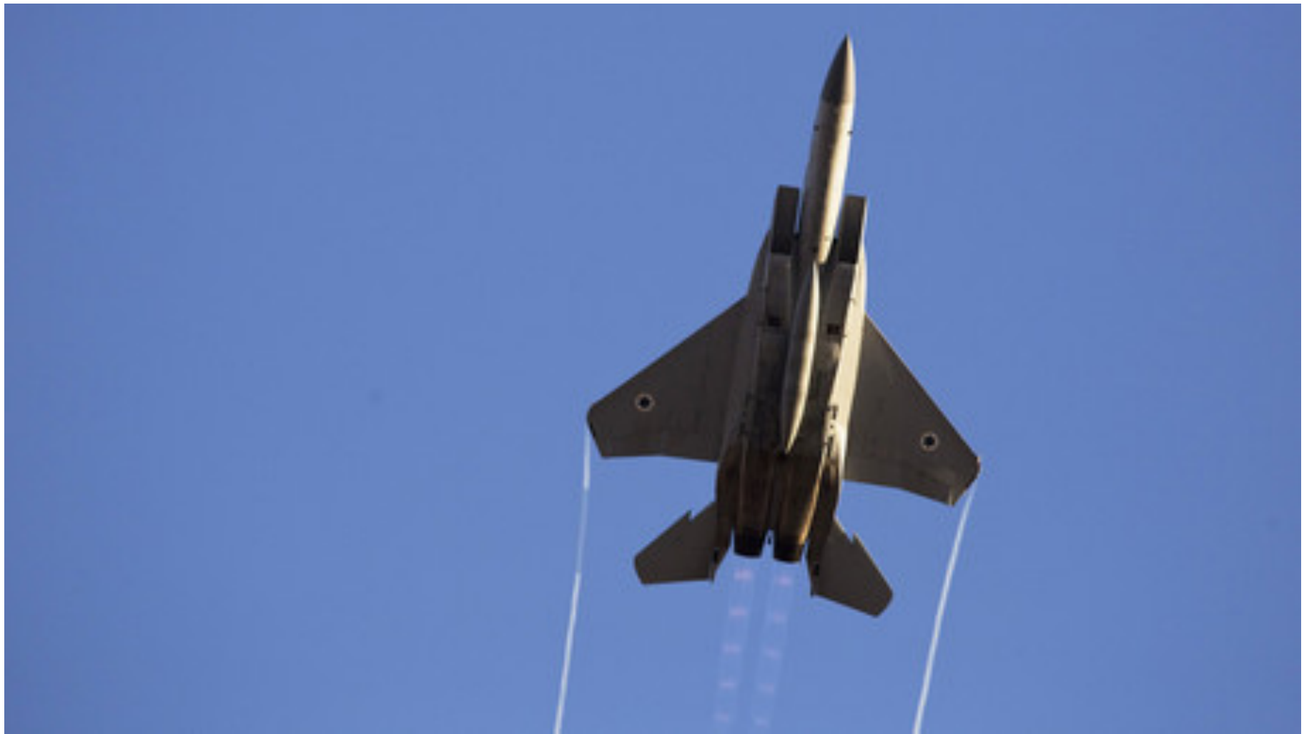
'Israel made a mistake by striking Syria & jeopardizing relations with Russia' – expert