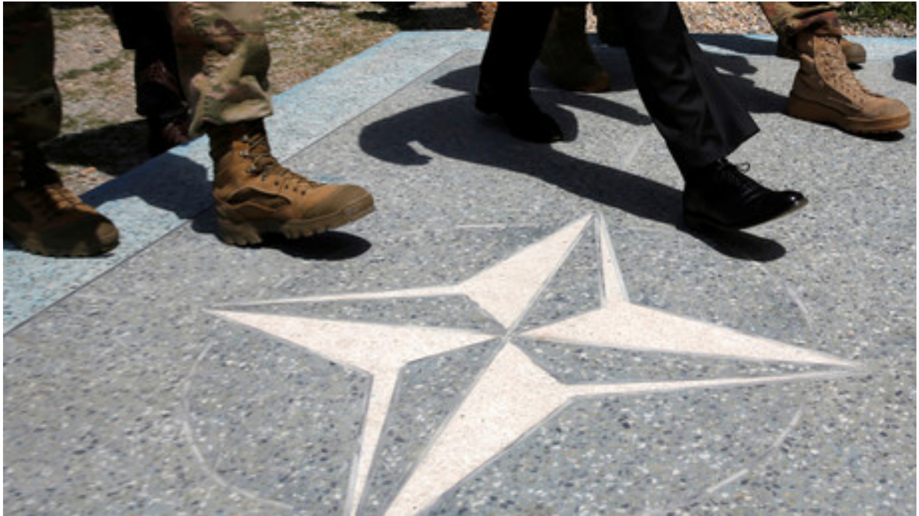
Top Russian & NATO military officials to meet over Syria next week – report