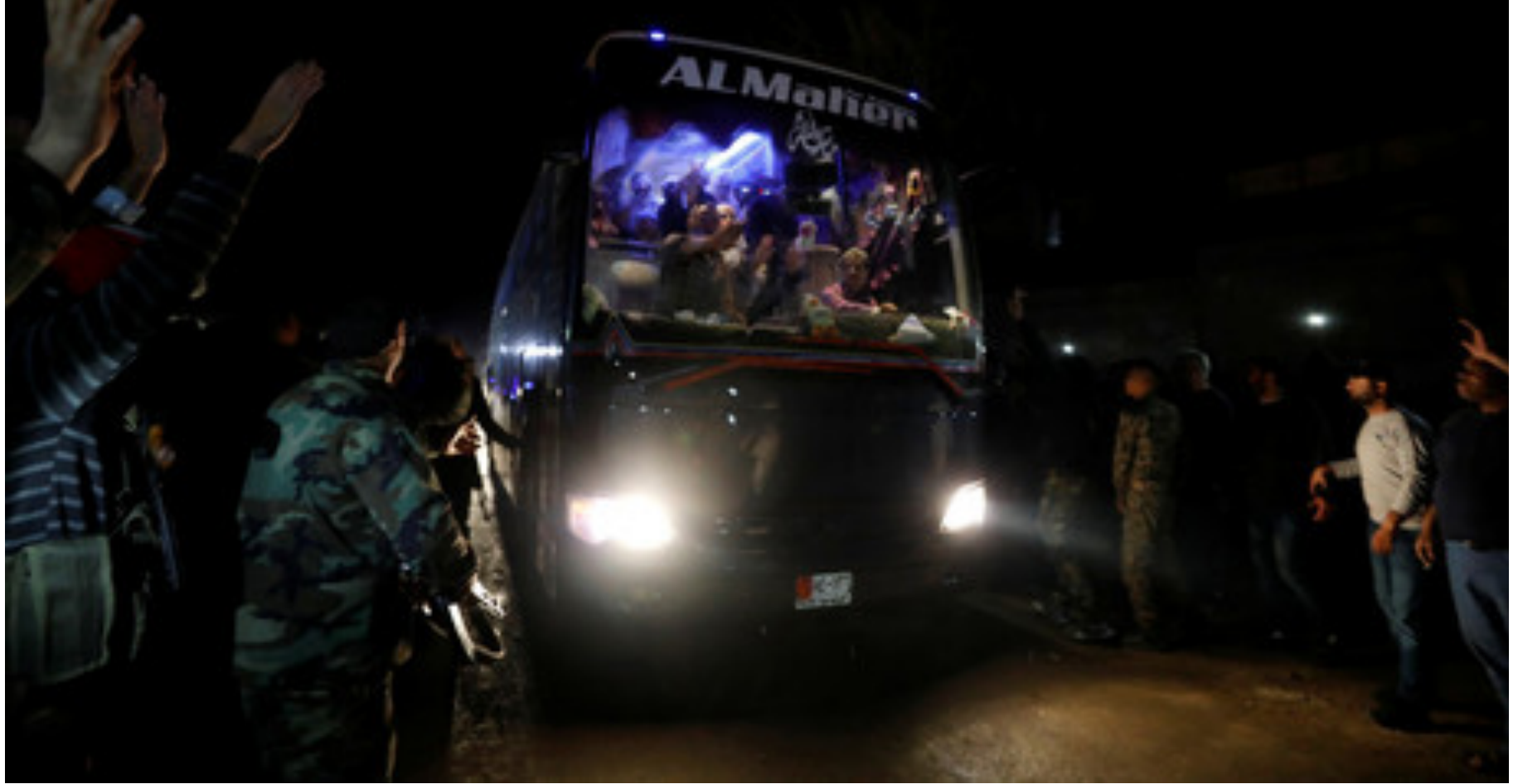
Thousands of Jaysh al-Islam militants leave Syria's Douma, release POWs