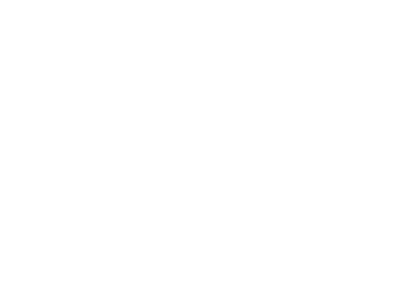
JAVID FURY 'Furious' Javid confronts Boris over decision to sack aide without telling him