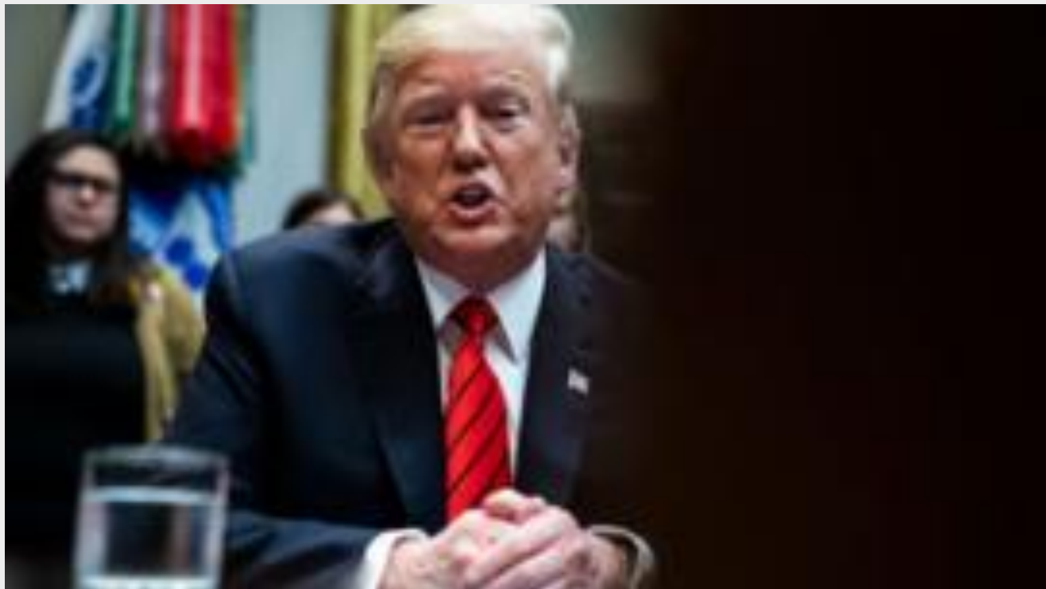
How a Trump tweet shook impeachment hearing