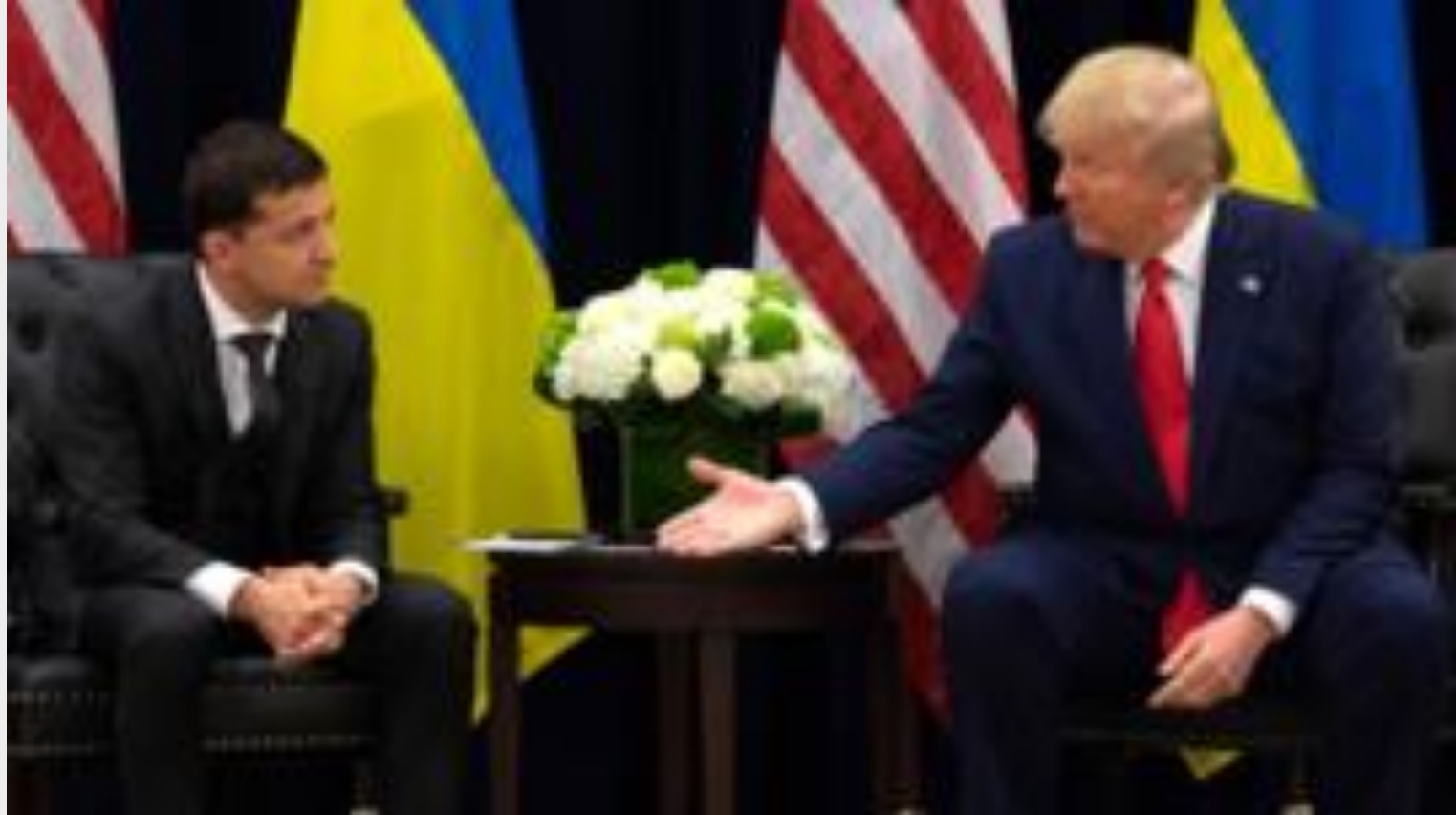
Why Ukraine is so important to the US