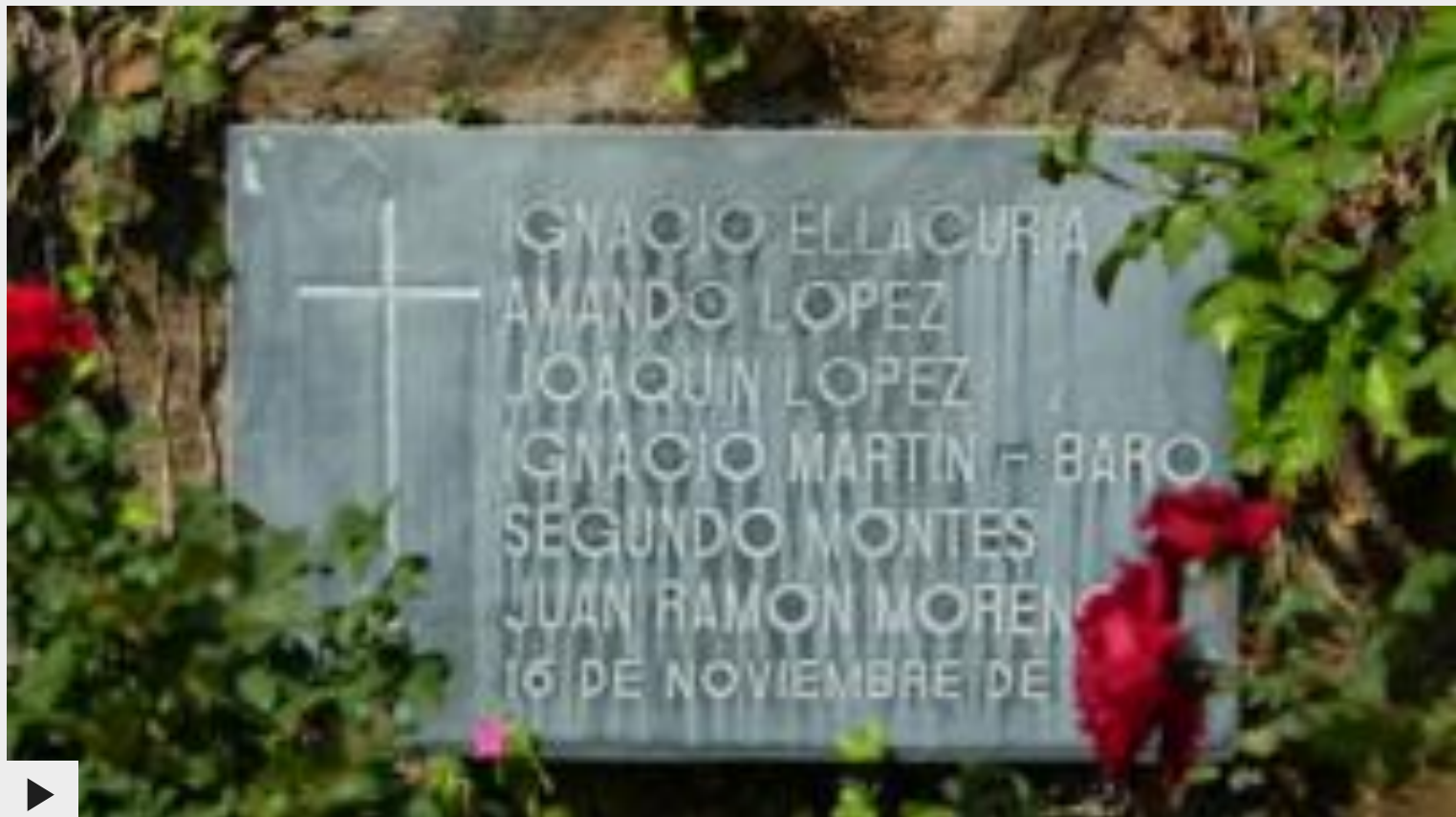
'I saw the soldiers who killed El Salvador's priests'