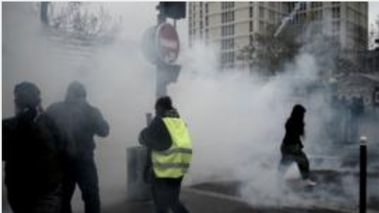
Anger of yellow vests still grips France a year on