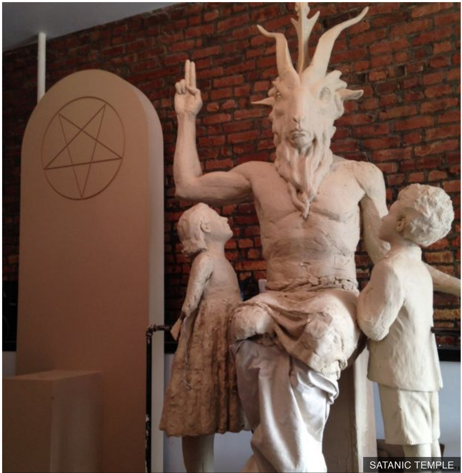
An early rendering of the statue and throne - featuring the inverted pentagram