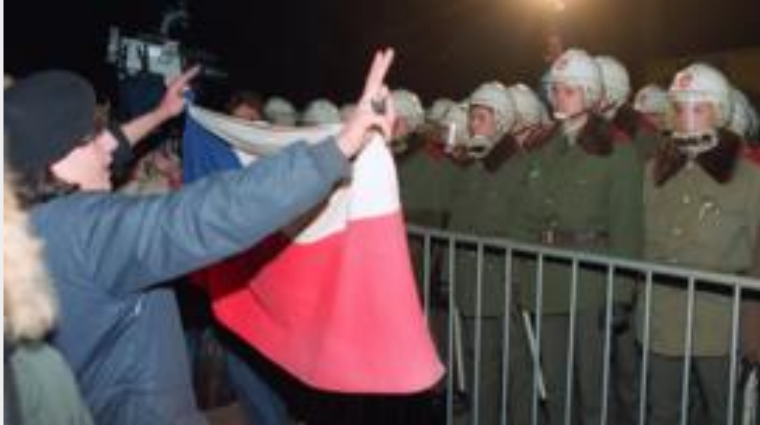
Velvet Revolution: Prague's ghosts of communism