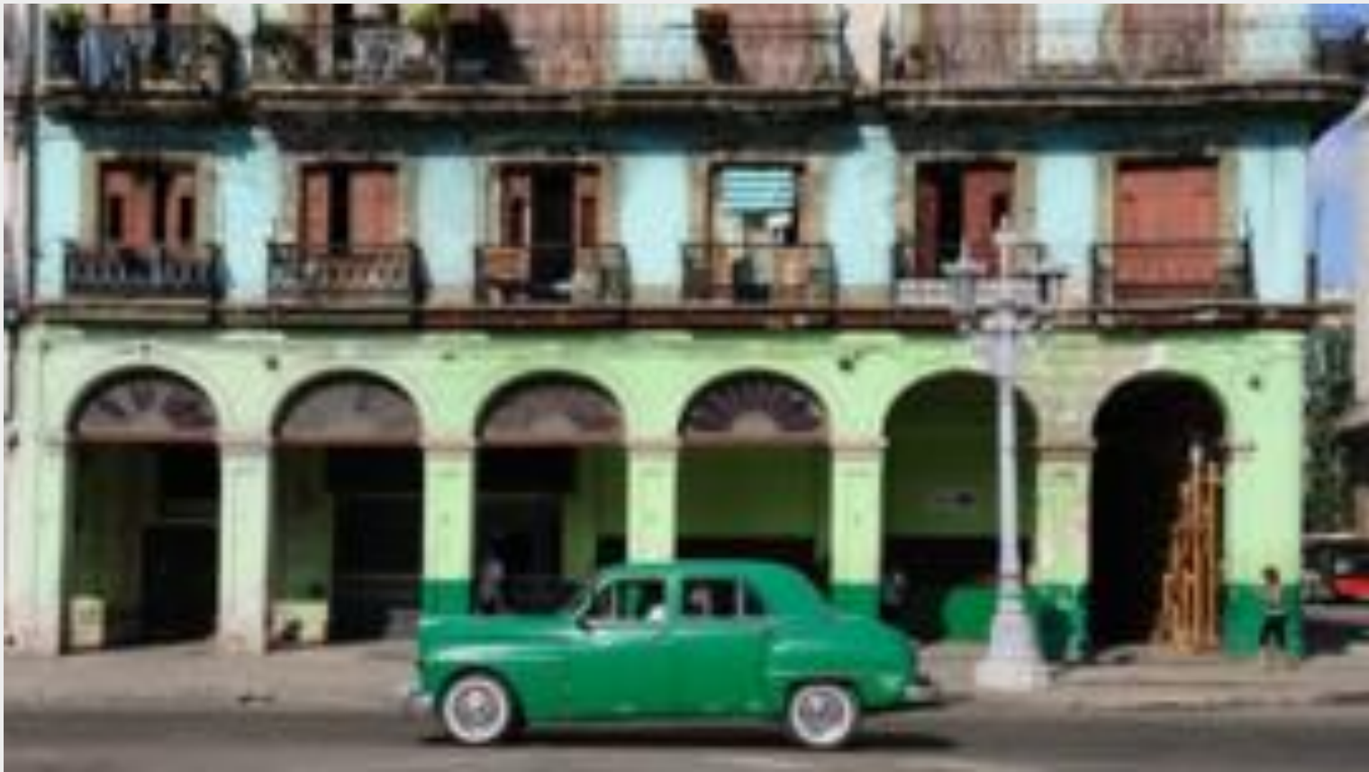
In pictures: A look at Havana at 500