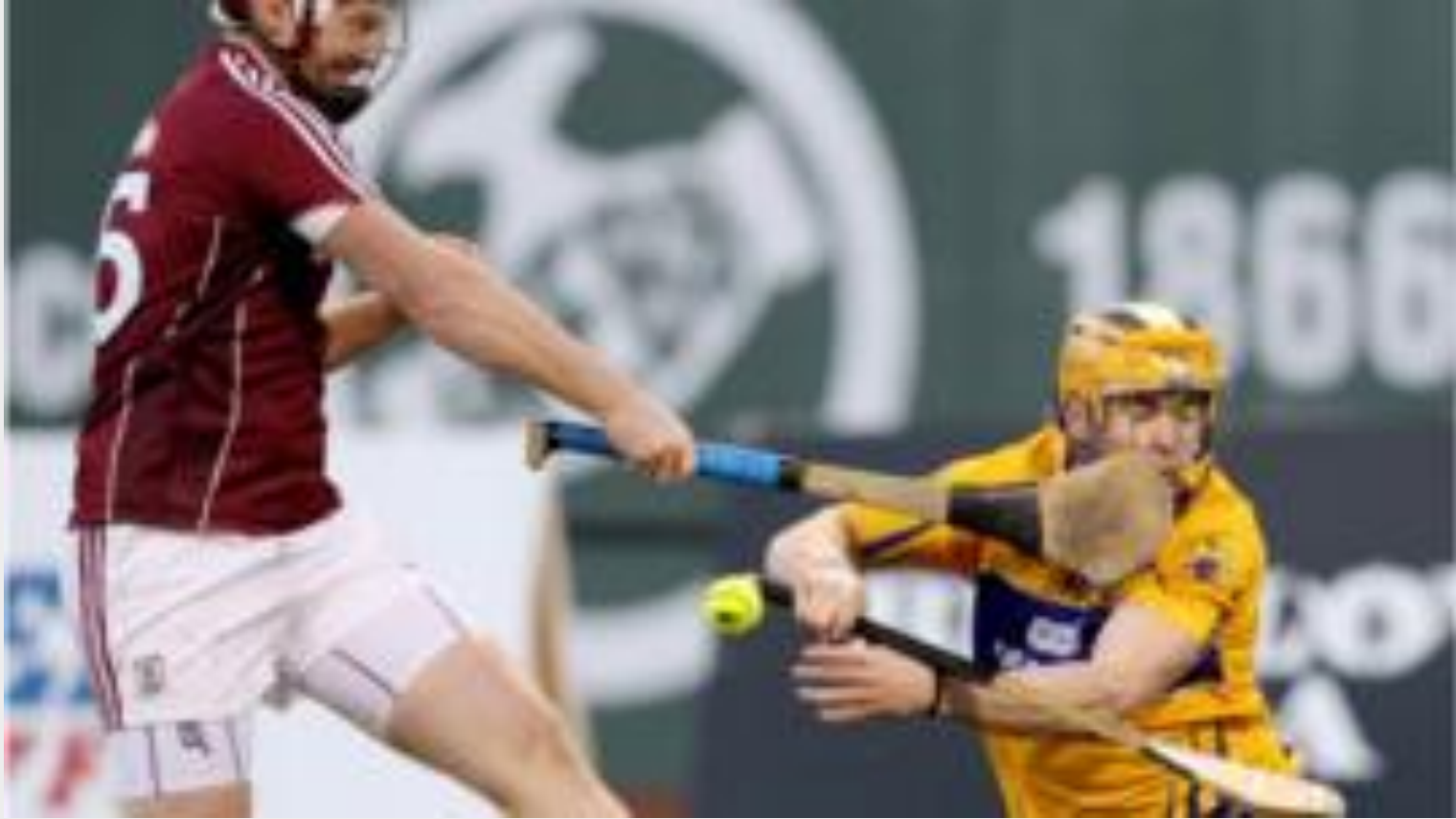
How the Irish sport of hurling came to the US