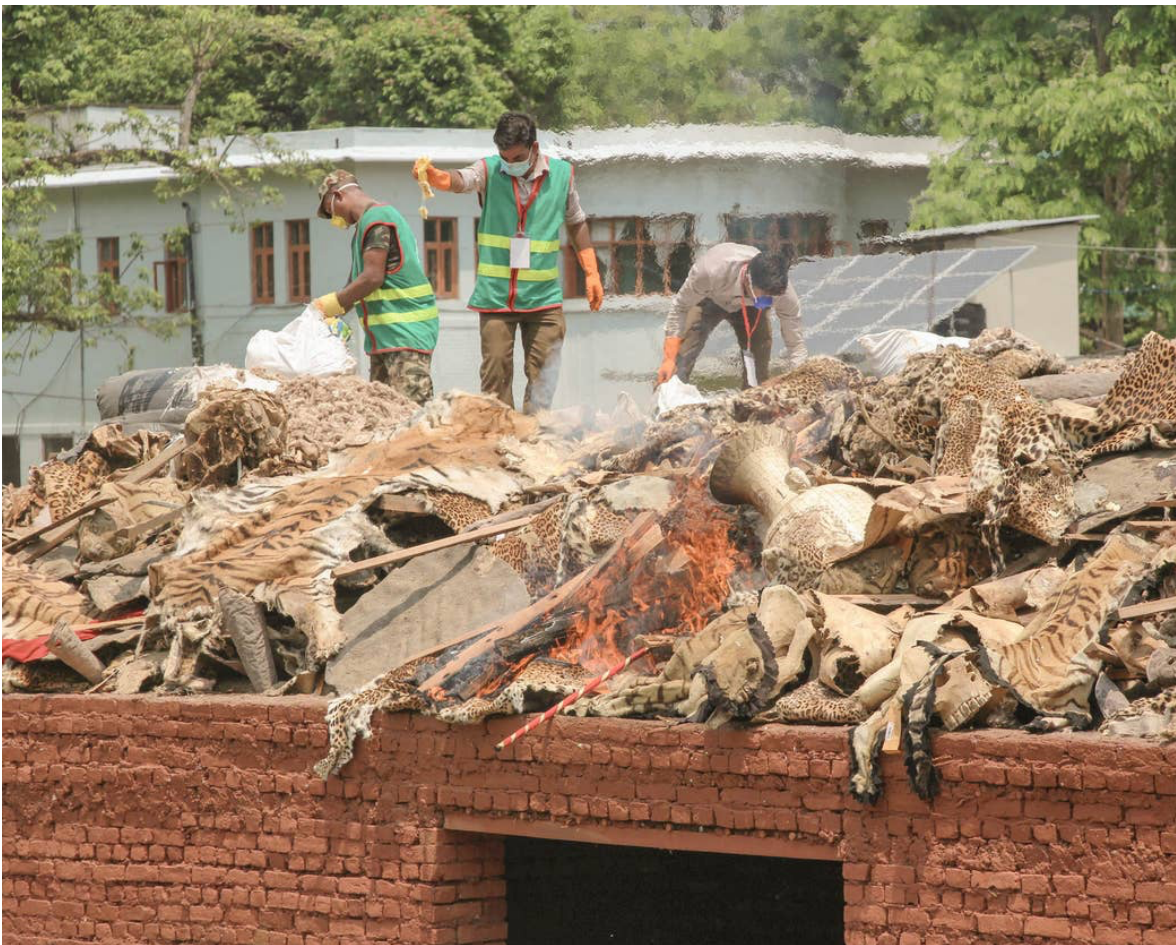
Nepali army personnel burn wildlife parts seized from poachers at Chitwan National Park.

The enemy is real, and dangerous. Poaching is a billion-dollar industry that terrorizes animals and threatens some species' very existence. Poachers take advantage of regions ravaged by poverty and violence. And the work of forest rangers is indeed perilous: By one 2018 estimate , poachers killed nearly 50 rangers around the world in the previous year. But like any conflict, WWF's war on poaching has civilian casualties.