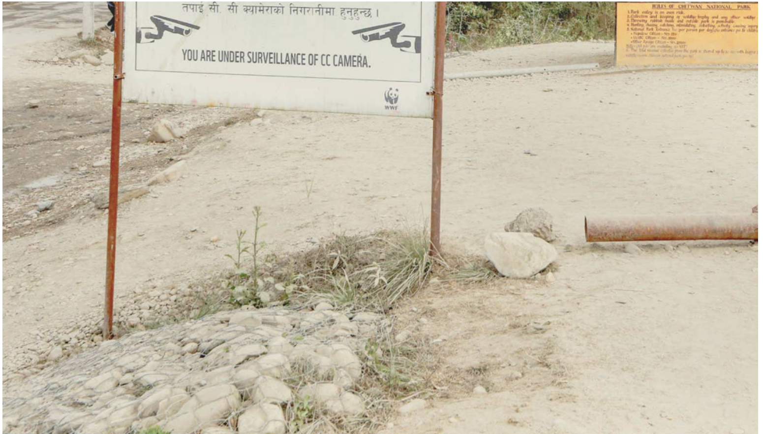
A sign near an entrance to Chitwan.