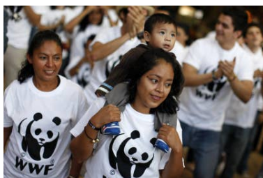
World Wildlife Fund activists demonstrate on the sidelines of the UN Climate Change conference.