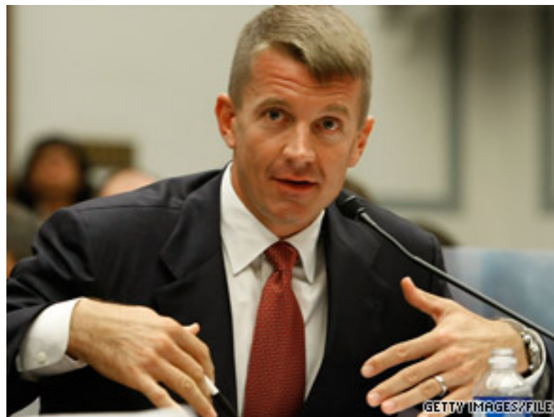
Blackwater founder Erik Prince, shown here before a congressional panel in 2007, recently left the company.

(CNN) -- Two former Blackwater employees have made statements against Blackwater Worldwide and its founder Erik Prince, accusing the security company and its former CEO of murder and other serious crimes in Iraq, according to court documents filed this week.