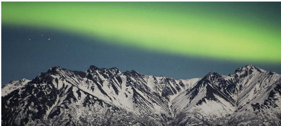
Scientists want to better understand the processes involved in creating auroras.