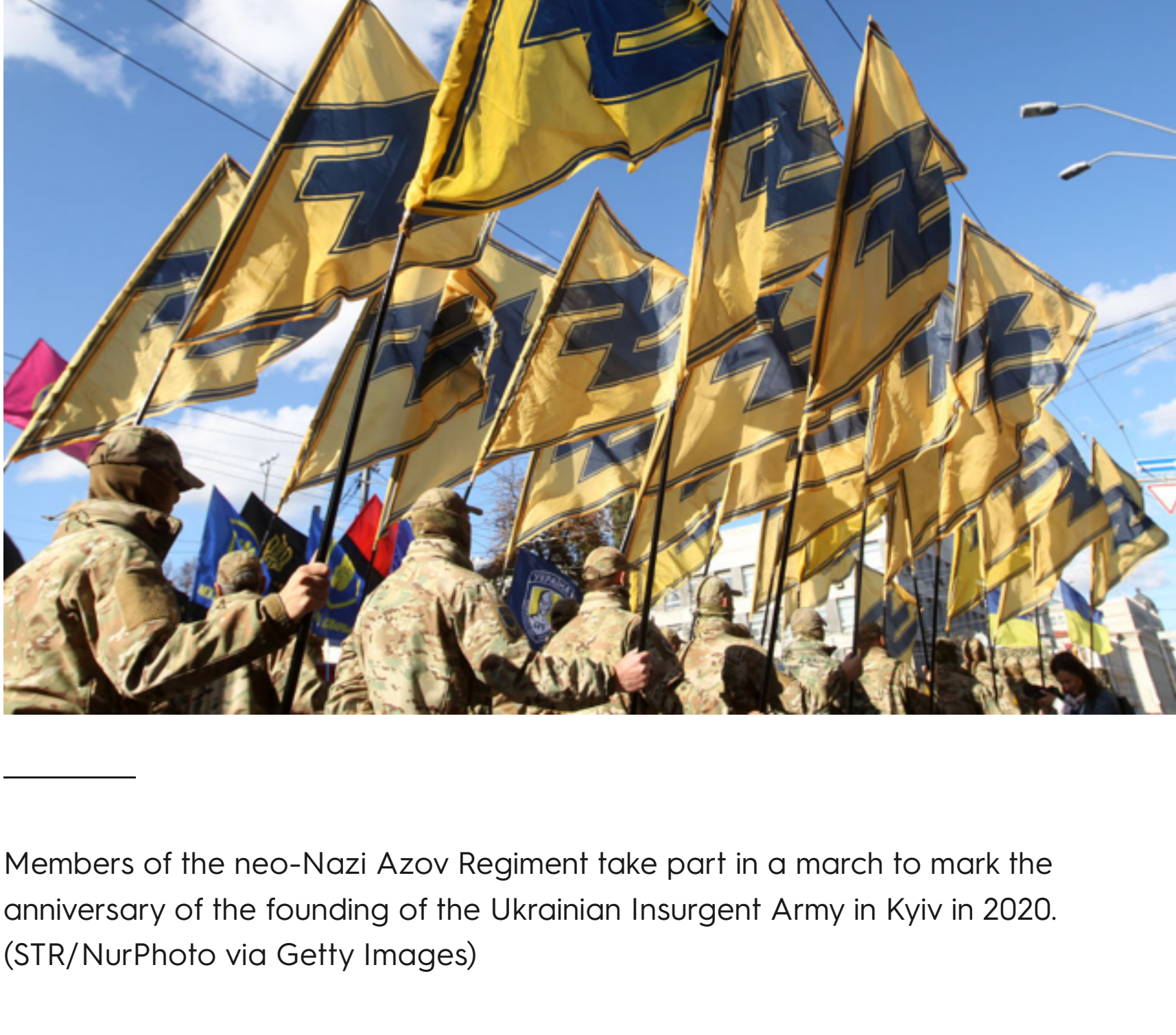
Members of the neo-Nazi Azov Regiment take part in a march to mark the anniversary of the founding of the Ukrainian Insurgent Army in Kyiv in 2020.

The CIA has been secretly training anti-Russian groups in Ukraine since 2015. Everything we know points to the likelihood that includes neo-Nazis inspiring far-right terrorists across the world.