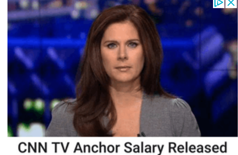
CNN TV Anchor Salary Released Viewers Vexed