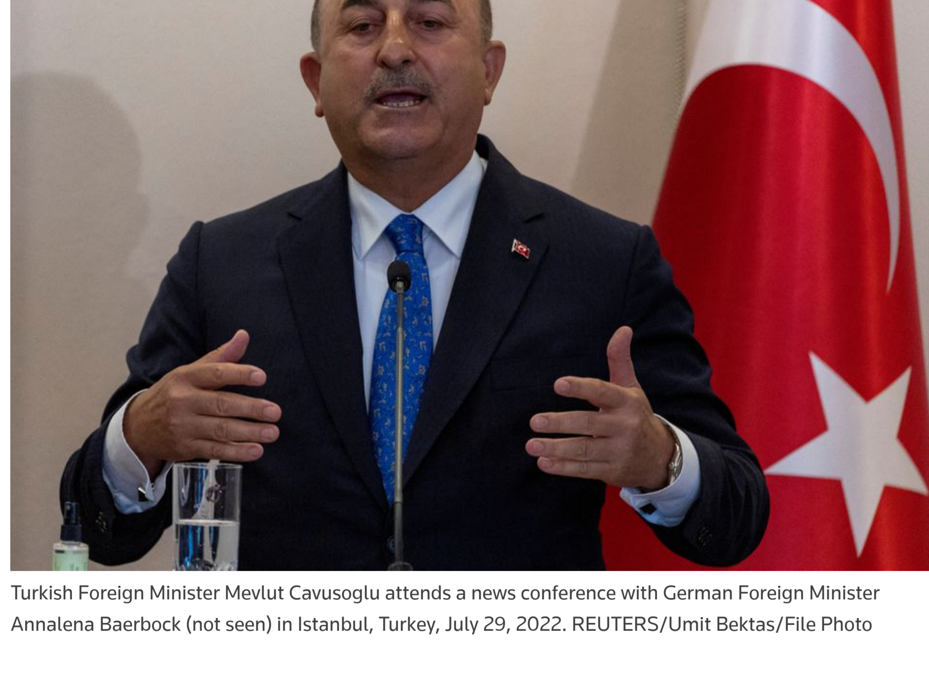
Turkish Foreign Minister Mevlut Cavusoglu attends a news conference with German Foreign Minister Annalena Baerbock (not seen) in Istanbul, Turkey, July 29, 2022.