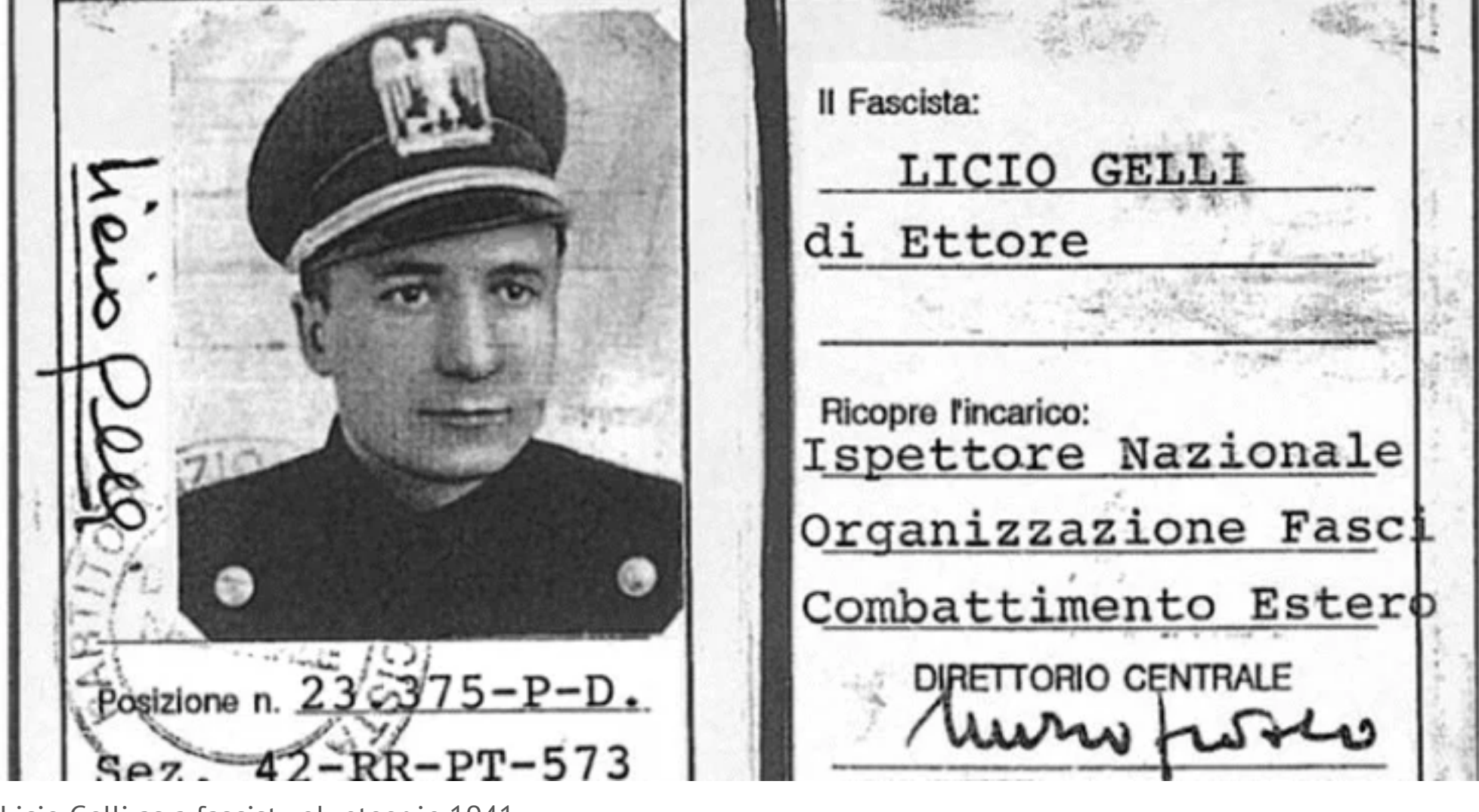
Licio Gelli as a fascist volunteer in 1941.