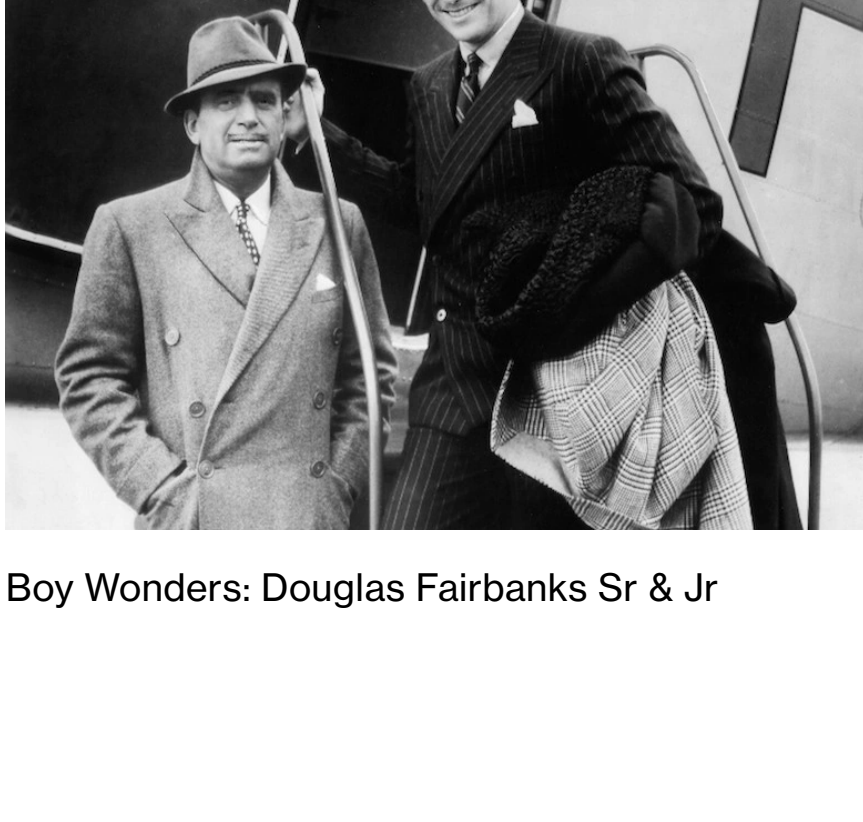
Boy Wonders: Douglas Fairbanks Sr & Jr