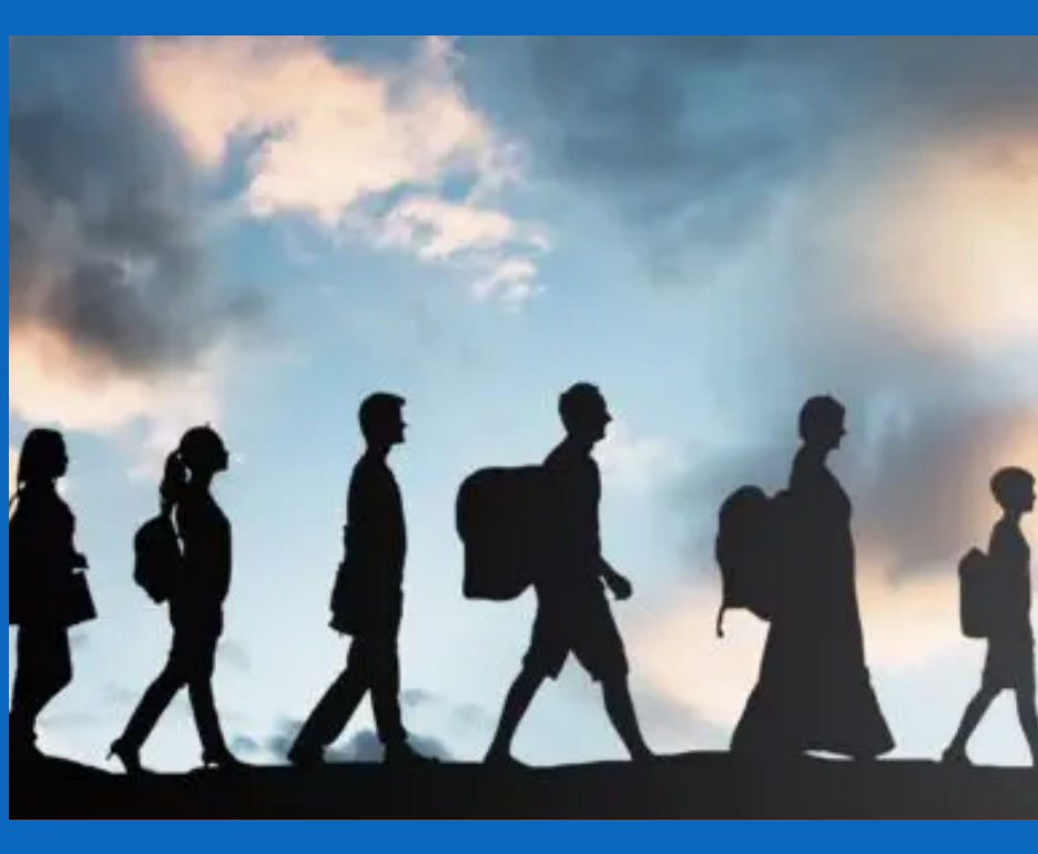
Seeking asylum at the border