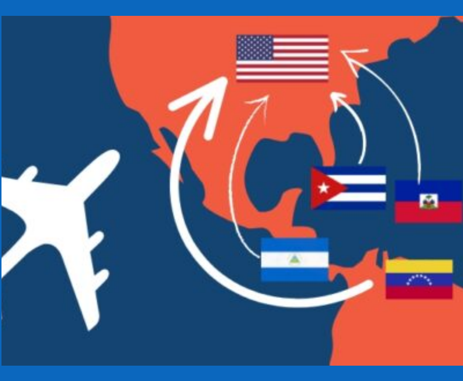
Processes for Cubans, Haitians, Nicaraguans & Venezuelans

Search Type what you want to search here