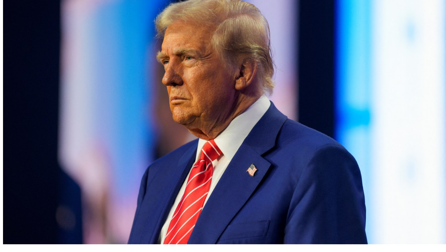
Donald Trump will be inaugurated in just over two weeks

Wednesday January 01 2025, 8.00pm GMT, The Times