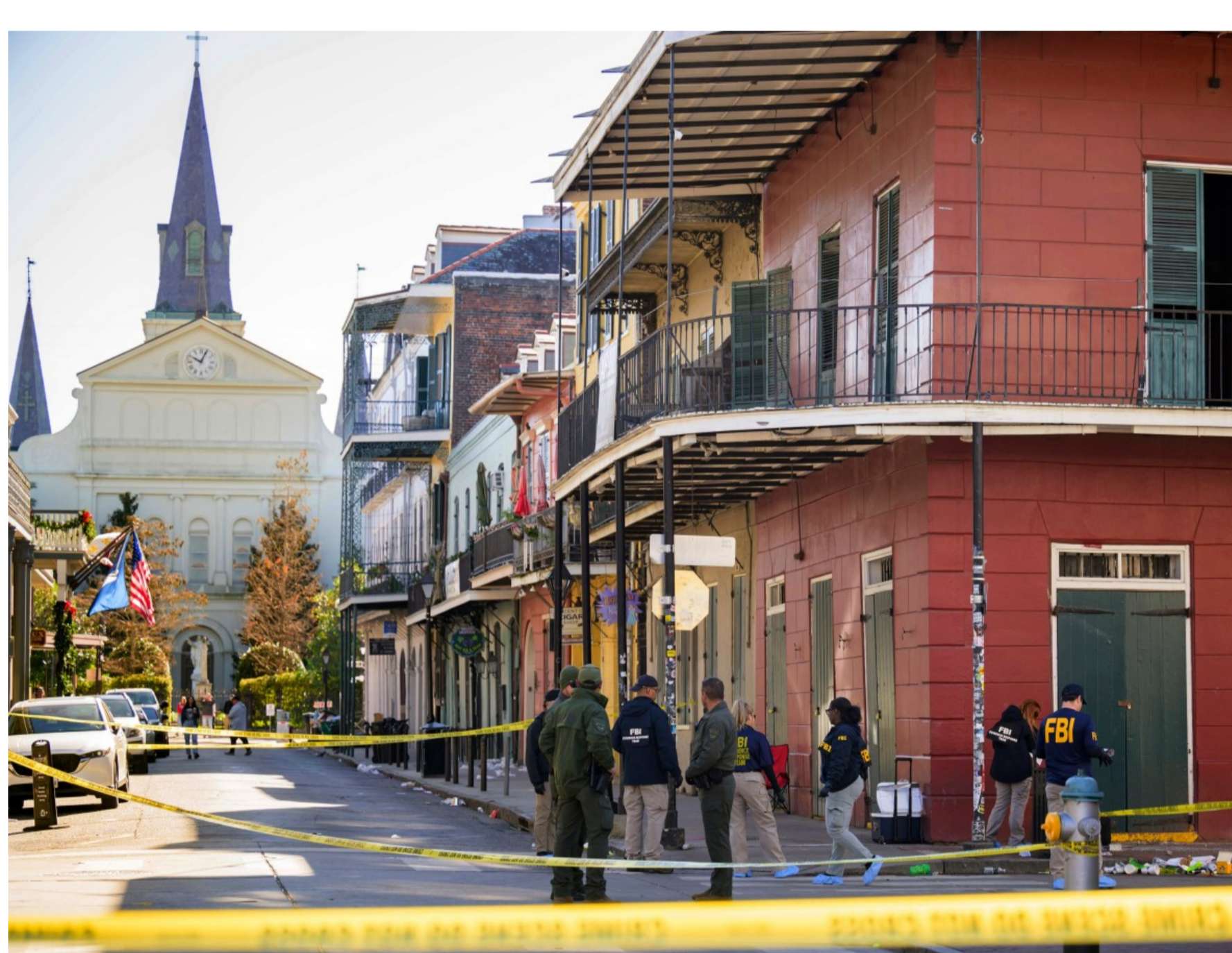
A heavy police presence remained in New Orleans

Since Bashar al-Assad's fall, Trump has said that the US will do best to stay out of Syria, where several thousand American troops are stationed.