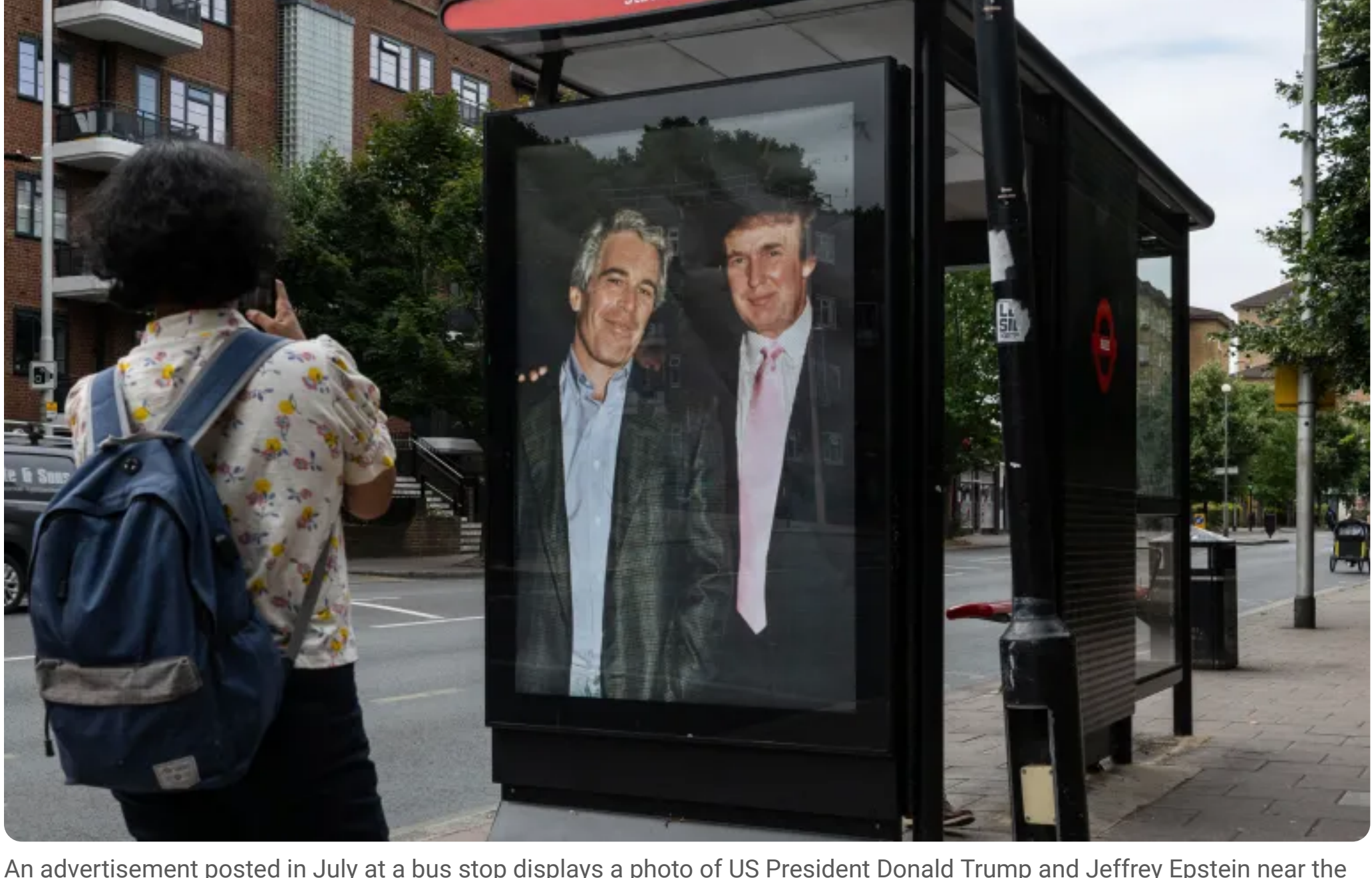
An advertisement posted in July at a bus stop displays a photo of US President Donald Trump and Jeffrey Epstein near the US Embassy in London

US federal judge rejects bid to unseal Epstein grand jury records as Trump administration tries to quell MAGA backlash.