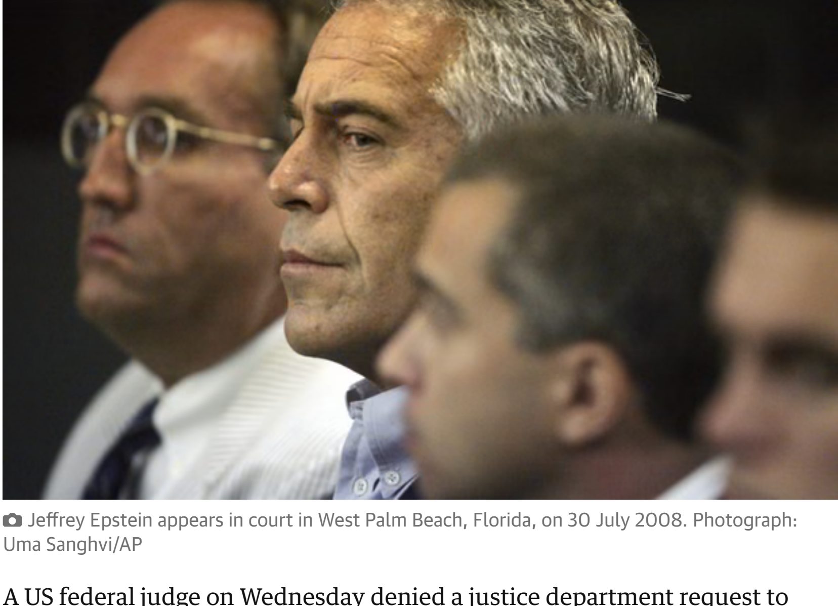
Jeffrey Epstein appears in court in West Palm Beach, Florida, on 30 July 2008.

Administration mired in scandal over president's previous links to sex offender in case that has rocked Maga base