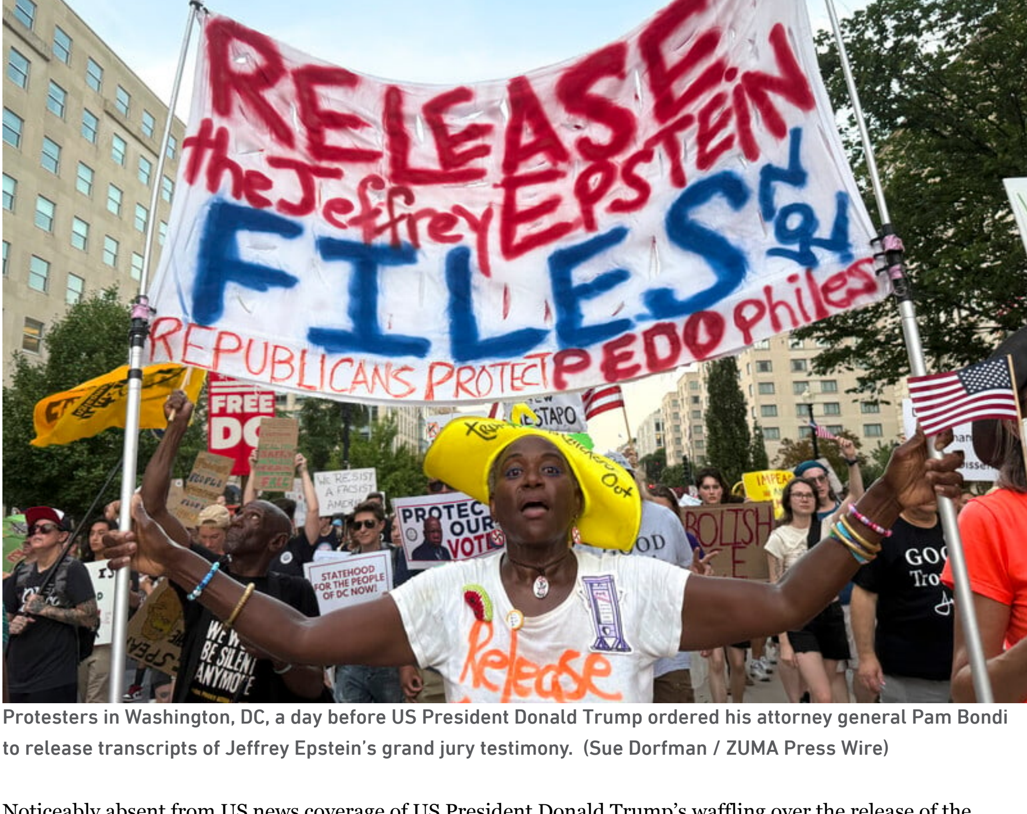
Protesters in Washington, DC, a day before US President Donald Trump ordered his attorney general Pam Bondi to release transcripts of Jeffrey Epstein's grand jury testimony.