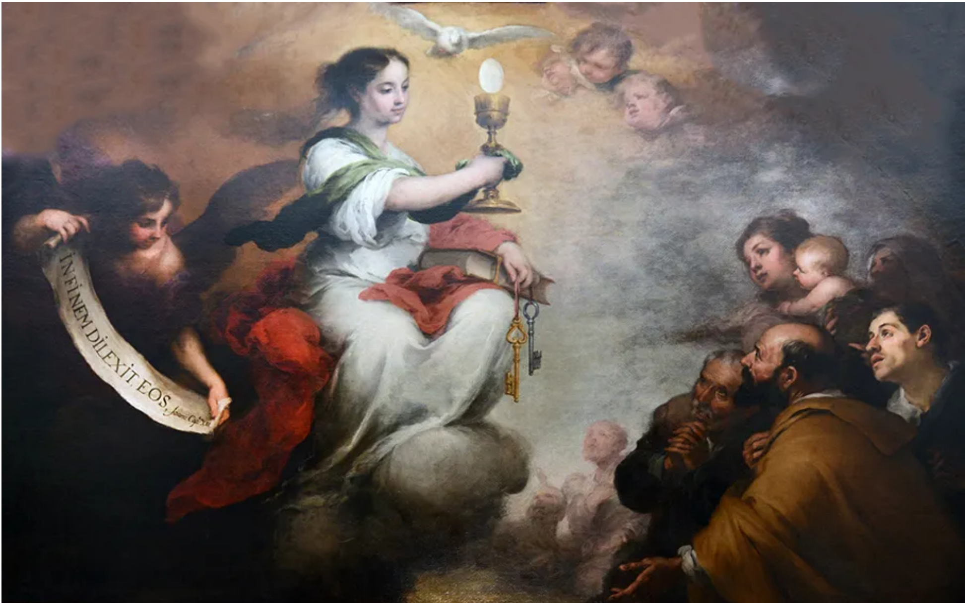
The Triumph of the Eucharist. Bartolomé Esteban Murillo.