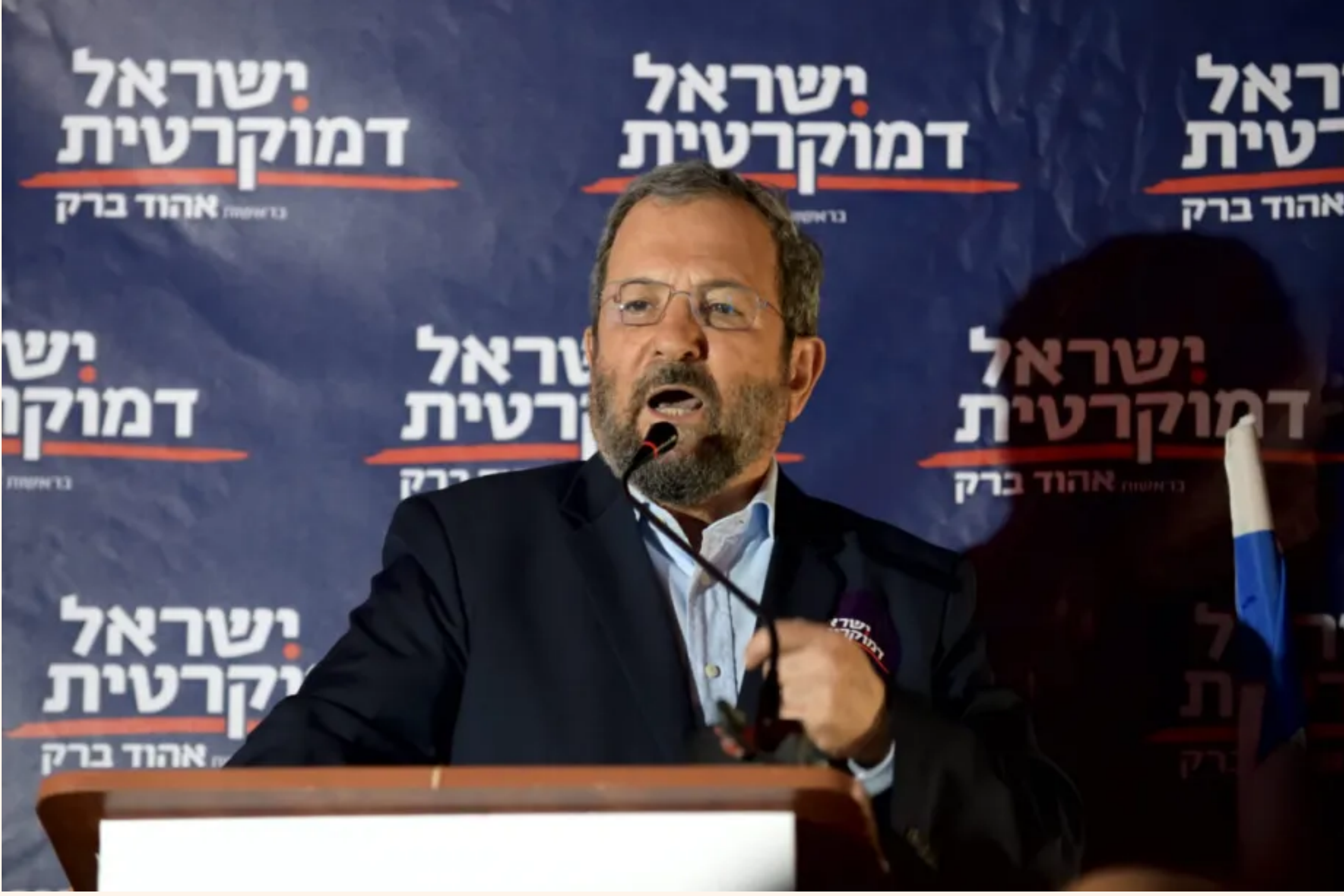
Former Israeli Prime Minister and leader of Israel Democratic party, Ehud Barak speaks at the Party's Election campaign event in Tel Aviv on July 17, 2019. Barak accused PM Netanyahu of being behind the article published the day before by Daily Mail that made it appear that he took part in a party with underage women at convicted sex offender Jeffrey Epsteins New York home in January 2016.