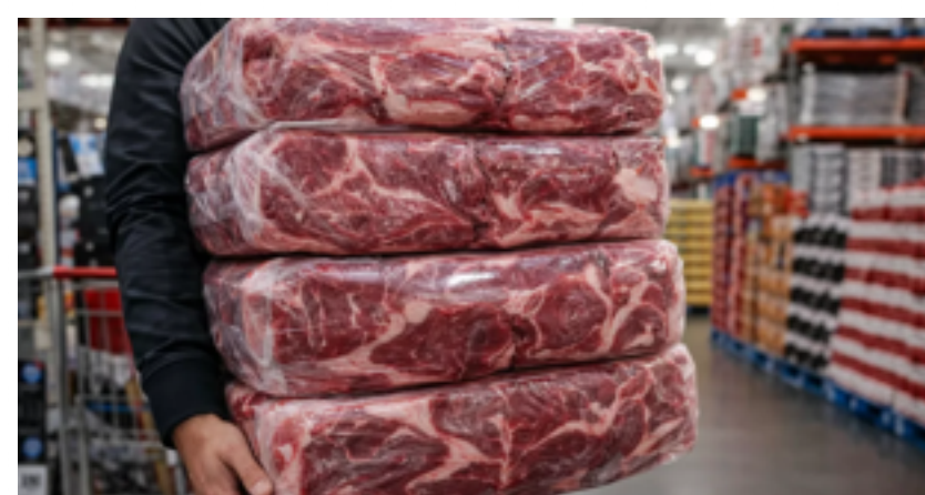
If You're Collecting Under $3950 In SSA a Month: You're Eligible for These 10 Discounts