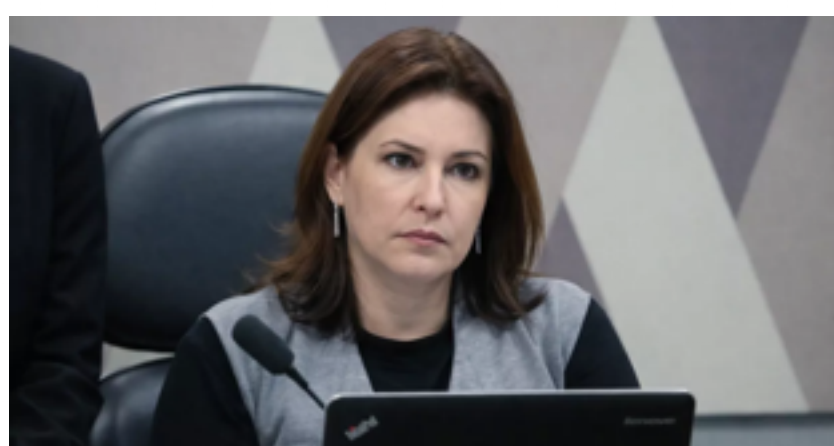
7 Big Social Security Changes