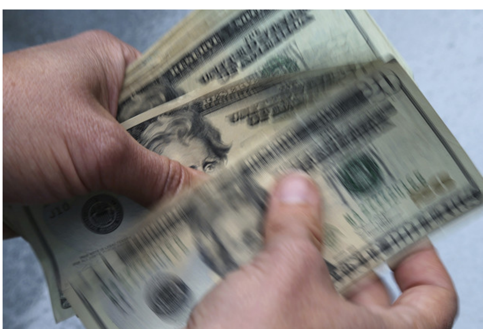
Twenty-dollar bills are counted.