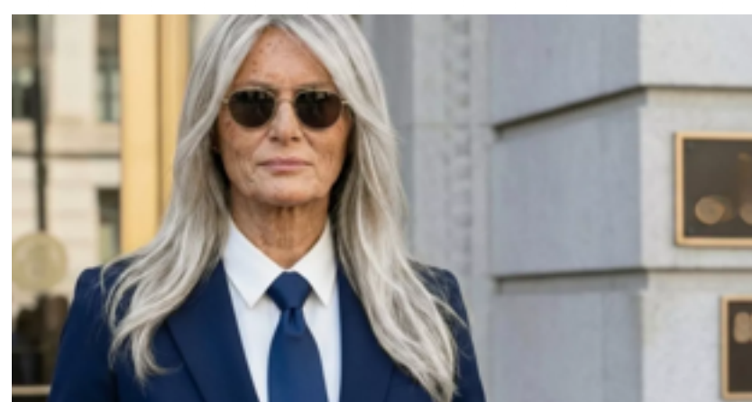
If You Get Social Security, Don't Skip This April Benefit Check